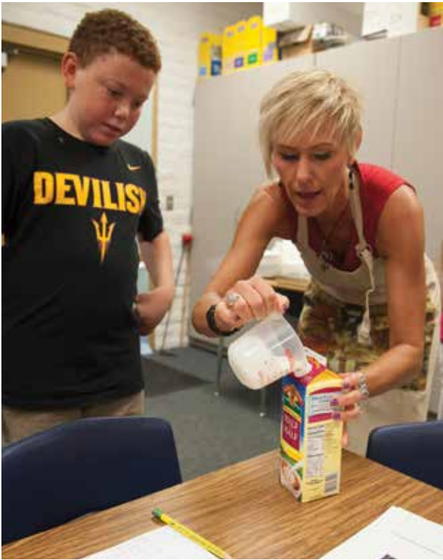
All courses are self-paced and taught by appropriately certified teachers.

Mesa Digital Learning Program (MDLP) will provide free online learning for enrolled students in grades 5 to 12.