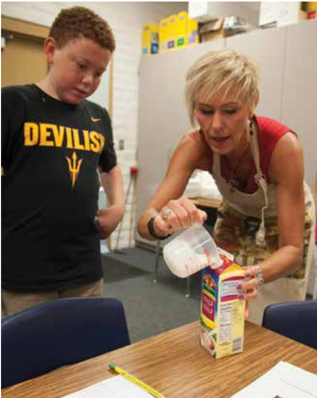
All courses are self-paced and taught by appropriately certified teachers.

Mesa Digital Learning Program (MDLP) will provide free online learning for enrolled students in grades 5 to 12.